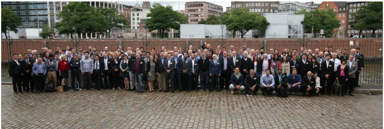
Figure 9. HySEA members at ICHS 2017, Hamburg