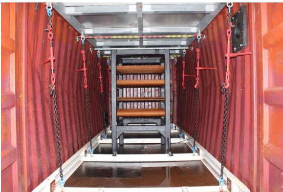
Figure 7. 20 feet-ISO container used for second blind-prediction tests, external and internal view