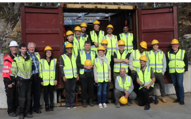
Figure 3. HySEA members during Second Demonstration meeting in Bergen

Gexcon organized the Second HySEA Demonstration at the test site on Sotra.