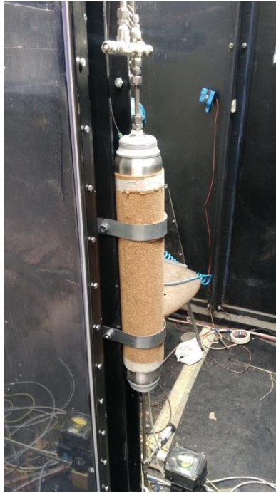
Figure 4. 3.785 lt Hydrogen buffer tank