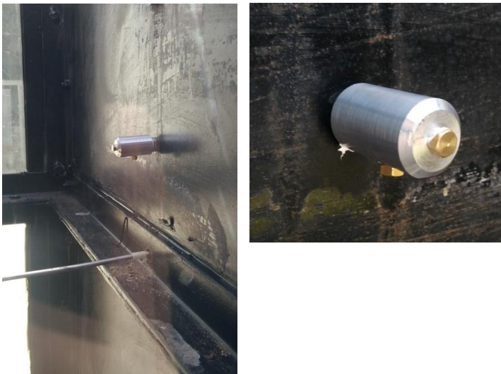
Figure 5. Release nozzle